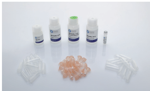
Tissue RNA Purification Mini Kit