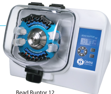
Bead Ruptor 12